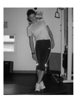
TFL/IT band stretch