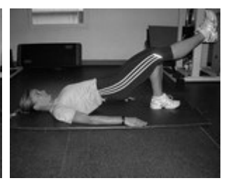
Bridge with addition of leg lift- Ensure that the hips stay in alignment and do not shift with leg lift. Distribute weight equally between feet and shoulders.