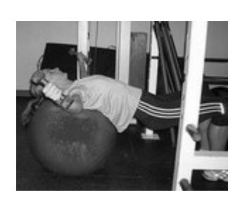
Flys with free weights- Lying on a ball or bench, hold equal weights in each hand. With feet firmly planted on the ground and core engaged, start with your hands together above you and then slowly lower weights to each side. Do not go beyond the plane of the body and keep the elbows soft. Lower and then return to start position each to a count of 3.